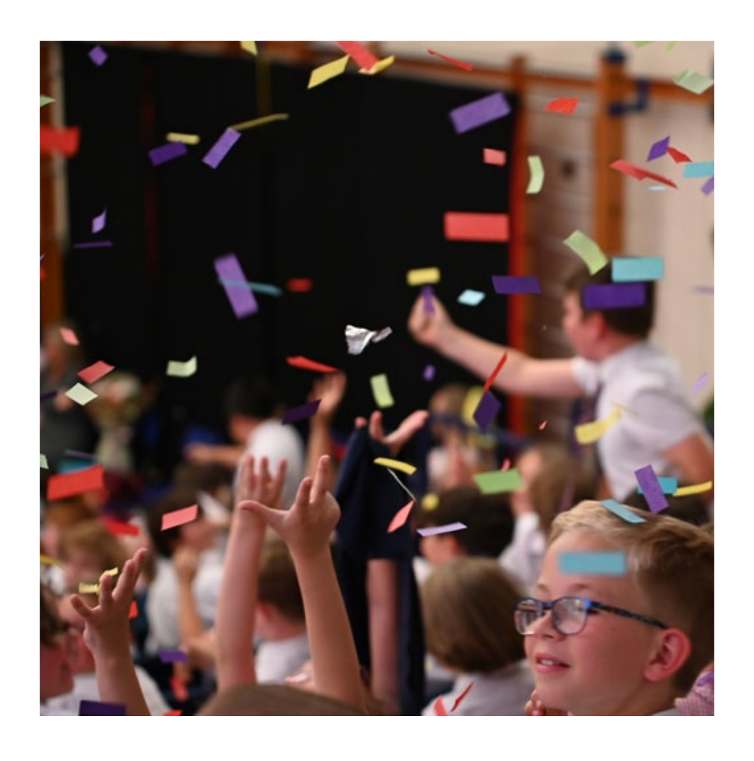
And, that's a wrap... have a great summer!