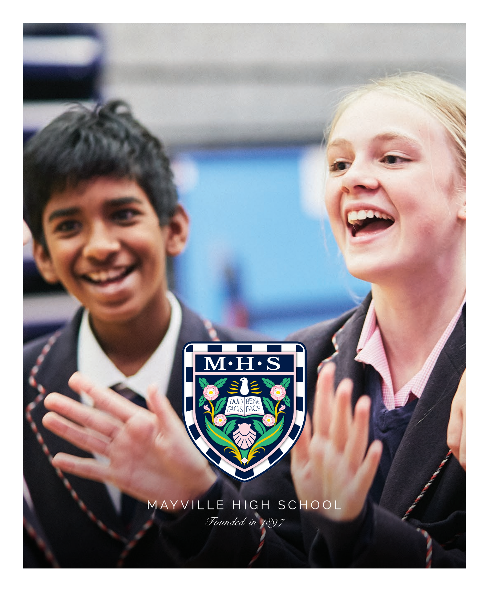
Mayville Senior School Information booklet 2023/24